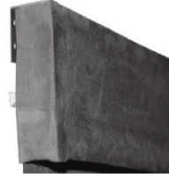
Outside Mount Valance with Returns