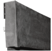
Outside Mount Valance with Returns