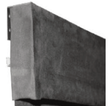
Outside Mount Valance with Returns